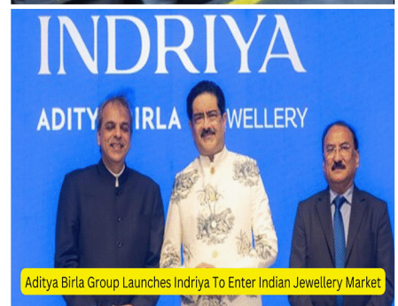
Aditya Birla Group Launches Indriya To Enter Indian Jewellery Market

(C) Aditya Birla Group has launched Indriya to enter the Indian jewelry market. Shri Kumar Mangalam Birla, Chairman, Aditya Birla Group has announced the launch of jewelry retail business. Due to which the group entered the rapidly growing Indian jewelry market worth Rs 6.7 lakh crore. This eponymous move is another important milestone.